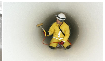
Final quality control on coated surface: visual, dry film thickness and spark testing