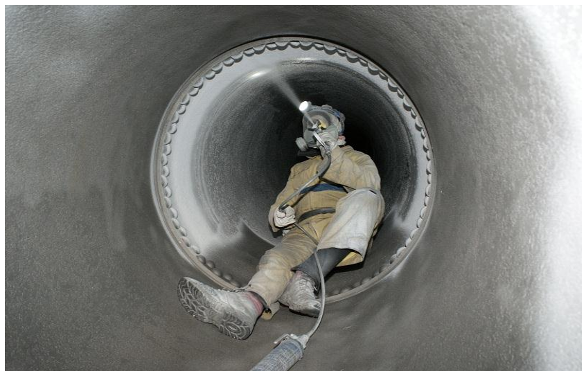
Application of the first layer in SPC 021 with airless spray equipment