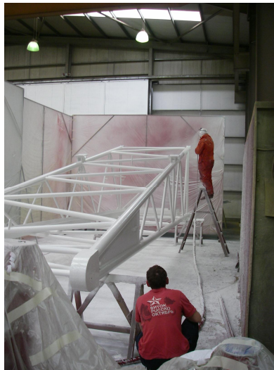
Picture above: white Humidur application Pictures right: red Humidur