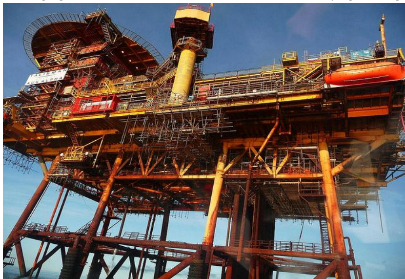
Clyde platform (up)