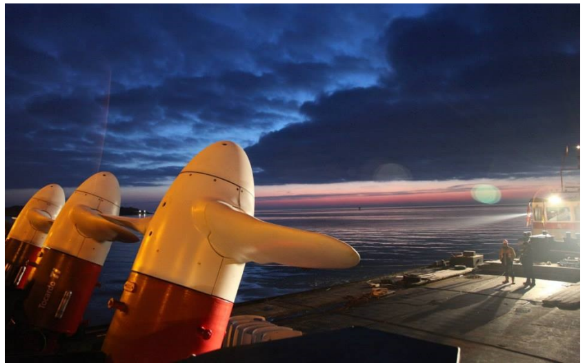
Coated Tocardo turbines in Den Oever, the Netherlands

Tocado will install five tidal turbines in the Eastern Scheldt storm surge barrier. This installation is both the largest tidal energy project in the Netherlands as well as the world's largest commercial tidal installation of five turbines in an array.