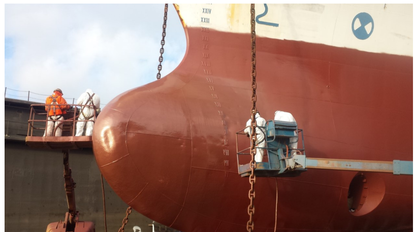
Application of Humidur®