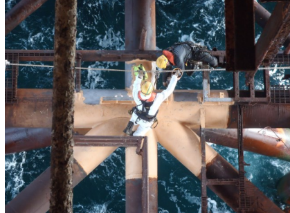
Stripe coating of sharp edges and welds