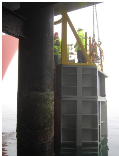
Cofferdam attached to tubular piles in water