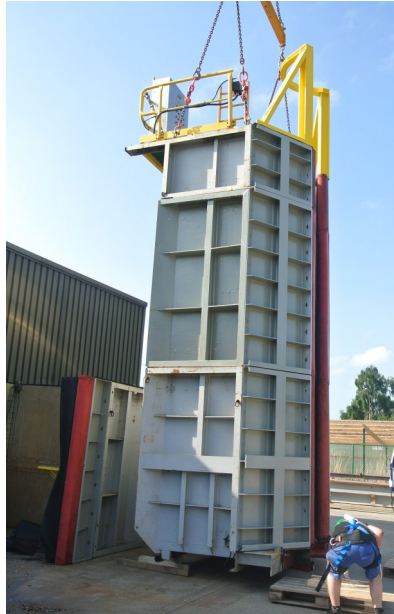
View of the cofferdam