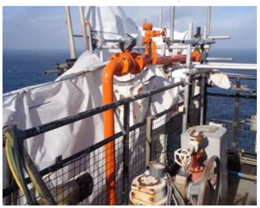
Coating repairs with \operatorname{Humidur} {\mathbb R}